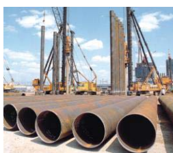
Steel pipe piles