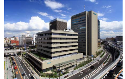
Kubota Head office Japan (Osaka)