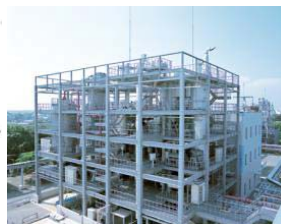
Sewage sludge incinerators