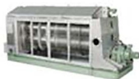
Sewage sludge dewatering machines