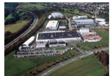
Kubota Baumaschinen GmbH (Zweibrücken factory - Germany)