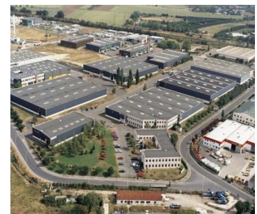
Kubota Europe S.A.S. (France)

Number of factories in the world (13 in Japan and 19 in overseas)