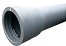
Ductile iron pipes

We are also supplying several kinds of pipes, construction materials, environment plants and several other products.